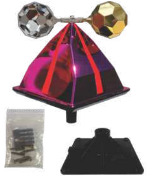
Eagle Eye Wind RED EA Wind Powered 08-EE-WDRB Deterrence for marine birds