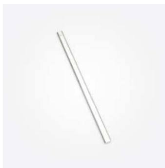
Eagle Eye Straight Pole EA Aluminium 19mm Pole 08-EE530 A30cm pole - for mounting Eagle Eye units. Other sizes available on request.