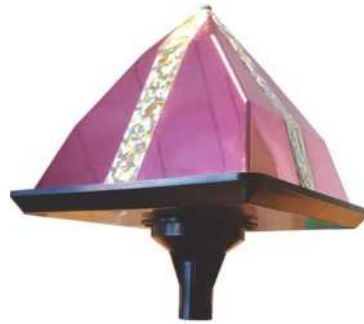
Eagle Eye RED EA Powered Unit 12v 08-EE2024 Solar, 240v or battery operated for marine birds