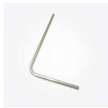
Eagle Eye Bent Pole EA Aluminium 19mm Pole 08-BP-24 Ideal for parapet mounting of Eagle Eye units.