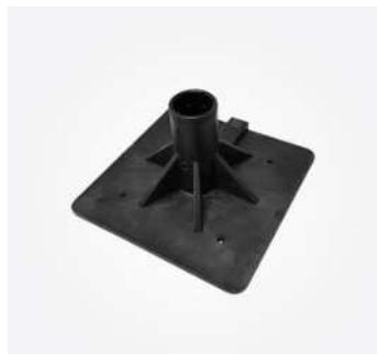
Eagle Eye Flat Bracket EA ABS plastic base 08-EE125 Use with 19mm poles