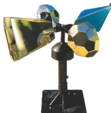
Pro-Peller SILVER EA Wind Powered 08-EE-PLL Deterrence for most birds