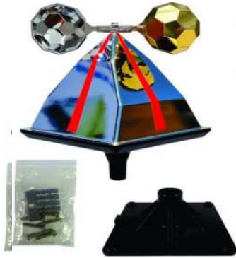
Eagle Eye Wind SILVER EA Wind Powered 08-EE-WDB Deterrence for most birds