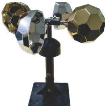
Bird Breezer SILVER EA Wind Powered 08-EE-BBS Deterrence for most birds