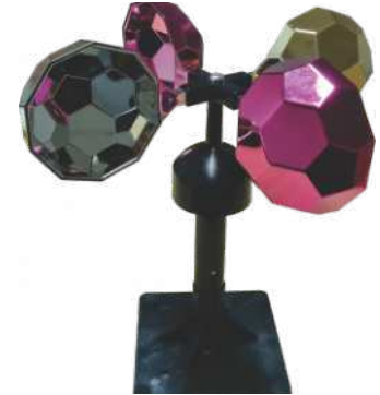
Bird Breezer RED EA Wind Powered 08-EE-BBR Deterrence for marine birds