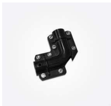
Eagle Eye Sliding Bend EA ABS plastic connection 08-EE146 Use with 19mm poles