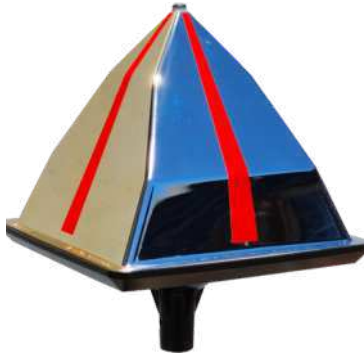
Eagle Eye SILVER EA Powered Unit 12v 08-EE2023 Solar, 240v or battery operated for most birds