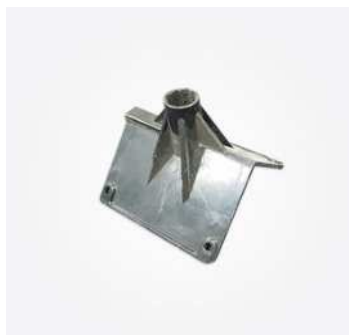
Eagle Eye Corner Bracket EA ABS plastic base 08-EE122 Use with 19mm poles