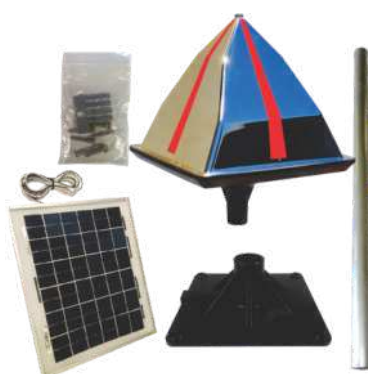
Eagle Eye Solar Kit EA Complete kit supplied with solar panel, base, post and fittings. Red - 08-EE-KIT02Red Silver - 08-EE-KIT002