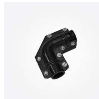
Eagle Eye Bend EA ABS plastic connection 08-EE108 Use with 19mm poles