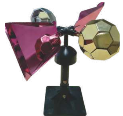
Pro-Peller RED EA Wind Powered 08-EE-PRED Deterrence for marine birds