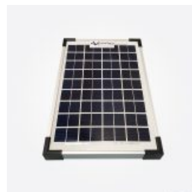
Eagle Eye Solar Panel EA Replacement solar panel for powering Eagle Eye units. 08-EE135

Please Note: A full range of components and fittings are available on request.