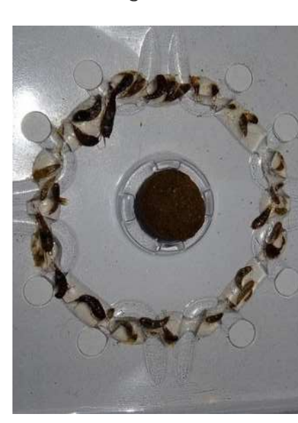
Viper Silverfish Trap