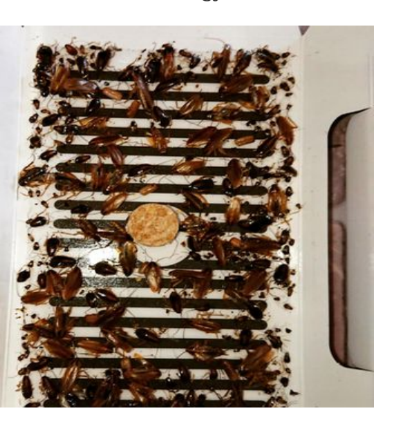
Viper Cockroach Trap

While there is a firm hold of pesticide use for insect control; PestIT's commitment is to develop modern, non-toxic and technology advancements to insect pest management as it has for rodent and bird management.