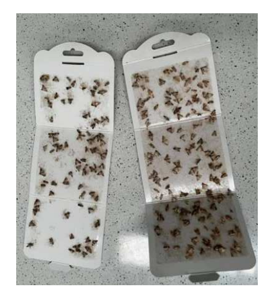
Viper Pantry Trap