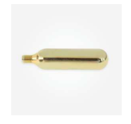
Magnet Trap Co2 EA Metal 07-trap9u Replacement 25g CO2 Cartridges for use in the Dispatching Kit