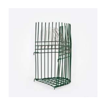
Myna Magnet Fuzzle Valve EA Coated metal & SS 07-trap9l One-way opening for the Mini Myna Magnet