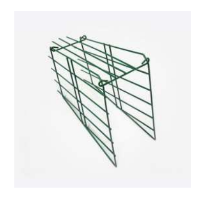
Myna Magnet Walk In EA Coated metal 07-trap9m Walk-In Valve for the Mini Myna Magnet