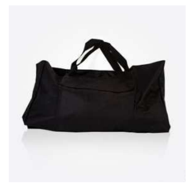
Pigeon Magnet Storage Bag EA Rip-Stop Material 07-trap9c After use, store your trap away in style to transport to your next job