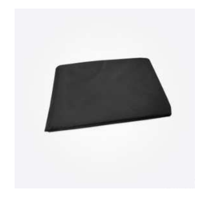
Myna Magnet Gassing Bag EA Rip-Stop Material 07-trap9a Suitable for use in euthanaising exotic birds using a car exhaust.