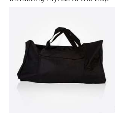
Myna Magnet Storage Bag EA Rip-Stop Material 07-trap9b After use, store your trap away in style to transport to your next job