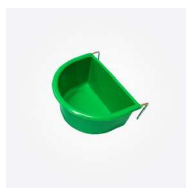
Myna Magnet Feed Set 2 PVC 07-trap9hi Water and Feed Set for attracting Mynas to the trap