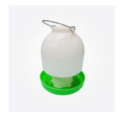
Pigeon Magnet Feeder SET PVC 07-trap9d Provides sufficient seed use in the Pigeon Magnet. Purchase as a Feeder and Drinker