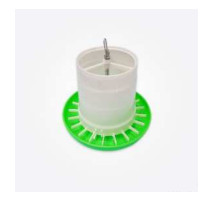
Pigeon Magnet Drinker SET PVC 07-trap9e Provides sufficient water use in the Pigeon Magnet. Purchase as a Feeder and Drinker set - 07-trap9f