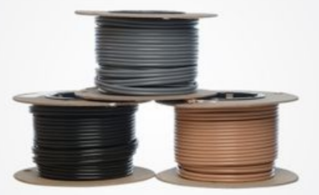
AvePro Shock Track Lead Wire