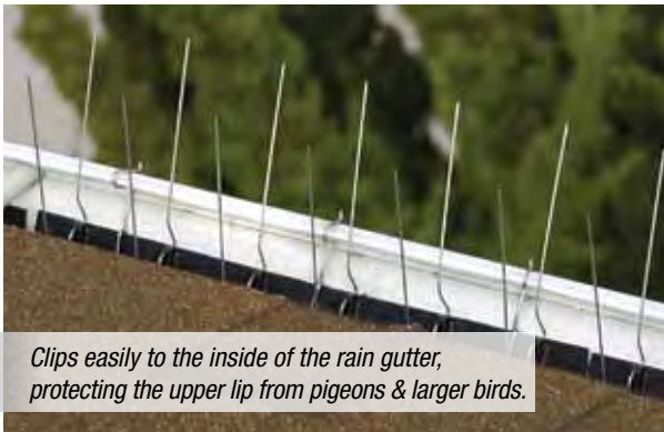
Clips easily to the inside of the rain gutter, protecting the upper lip from pigeons & larger birds.

Simply slip the stainless steel clips provided over the upper lip of the gutter and move on to the next section.