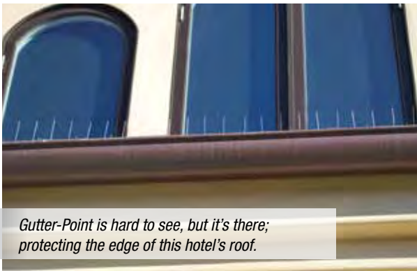
Gutter-Point is hard to see, but it's there; protecting the edge of this hotel's roof.