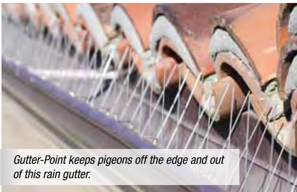
Gutter-Point keeps pigeons off the edge and out of this rain gutter.