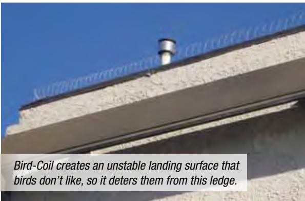
Bird-Coil creates an unstable landing surface that birds don't like, so it deters them from this ledge.